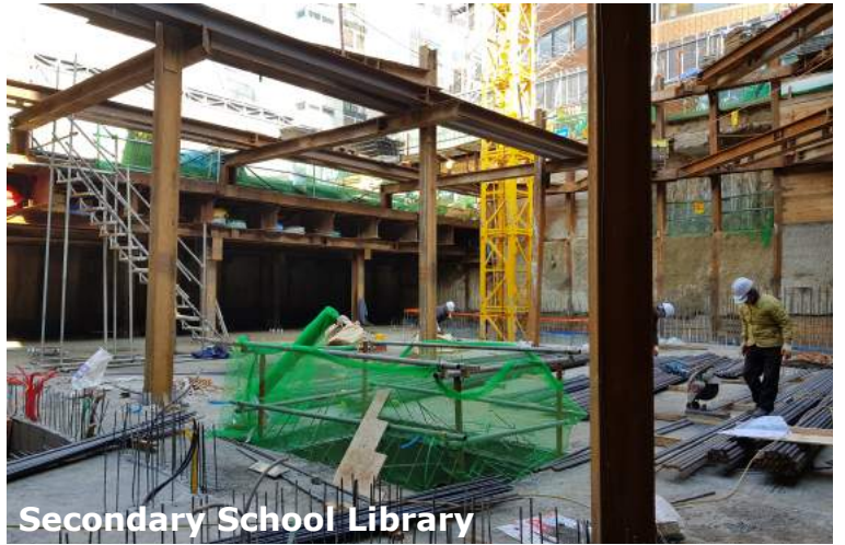
Secondary School Library