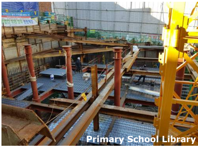
Primary School Library